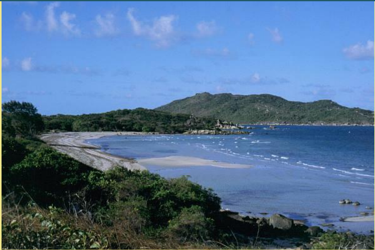
Iron Range Nationalpark und Restoration Island

Der weisse lange einsame Strand » Chili Beach im Iron Range Nationalpark lädt zum Verweilen ein. Zur Strandlektüre eignet sich besonders die Meuterei auf der Bounty, liegt doch in unmittelbarer Nähe Restoration Island. Sie erhielt von Captain Bligh ihren Namen. 1789 meutert die Besatzung der HMS Bountry und setzt Captain William Bligh in ein Beiboot auf hoher See aus. Restoration Island ist der Ort an dem er das erste Mal wieder festen Boden unter den Füßen hatte.